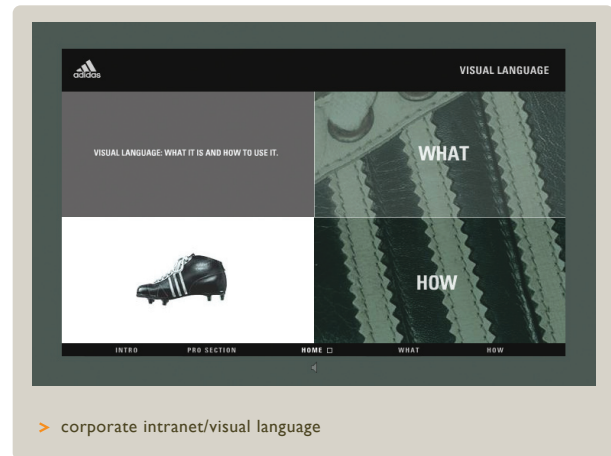
> corporate intranet/visual language

RESULT: The finished product was designed to act more like a software application than a website. At the same time, it effectively supports adidas' brand identity and visual language in look and feel. Above all else, this site presents a live, highly "connected," and up-to-the-moment window into the adidas brand, for inspiration and accurate performance of employees and authorized vendor-partners alike.